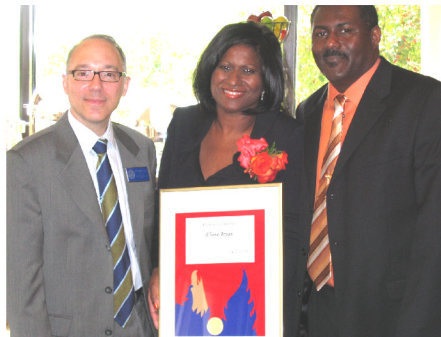
City of Atlanta Phoenix Award