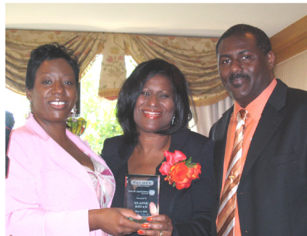
TBS Education Excellence Award