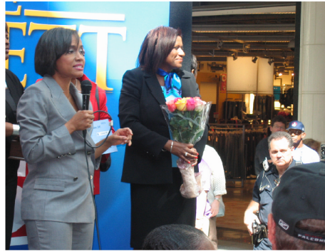
Educational mentoring award